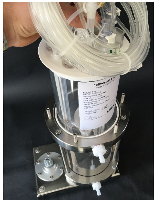
8. Careful you place SUB down in