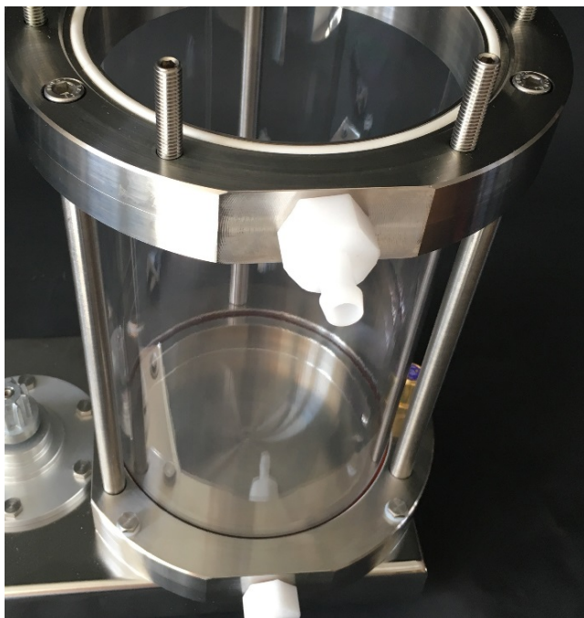
7. Make sure it tighten firmly