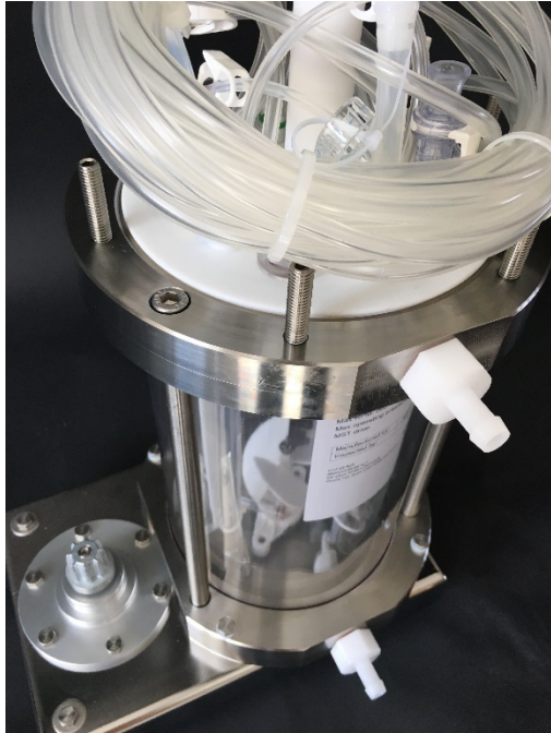
9. Make sure it is center in the RUJ