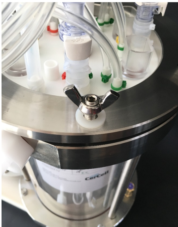
11. Place the ID6.5 dish's and screw the wing nuts on the RUJ. Make sure they're tighten firmly.