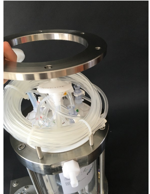
10. Place the cover ring on the RUJ