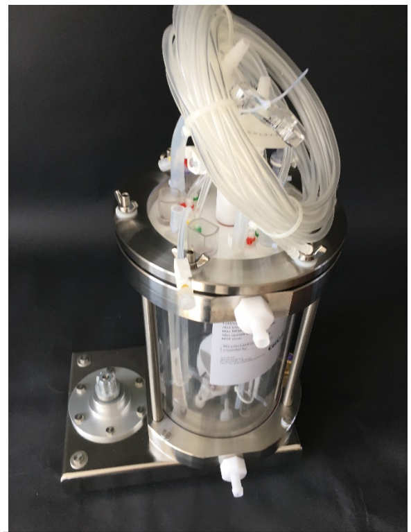
12. You're now ready to use the RUJ, last step is to connection your own water hoses and motor