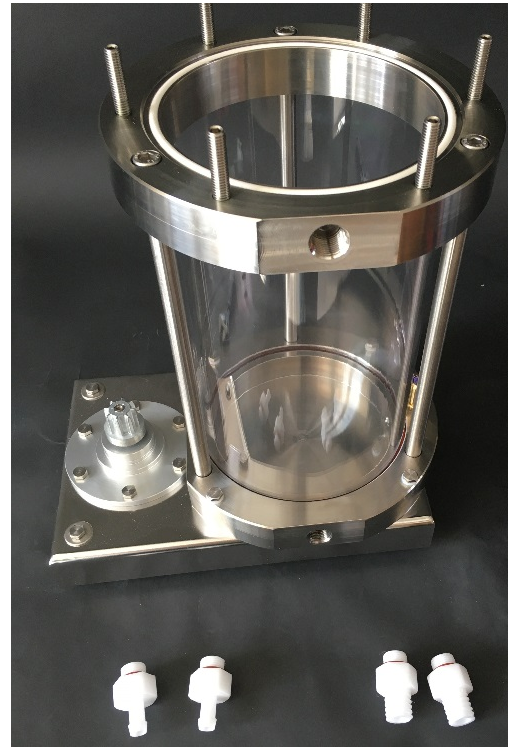
6. You're now ready to mount our own adapter