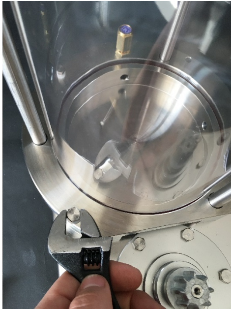
5. Make sure it tighten firmly