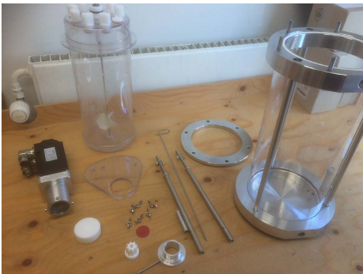
Overview of all components