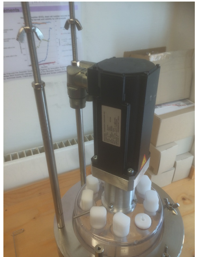
8 step; Place the motor. Make sure to tighten the 4 bolts