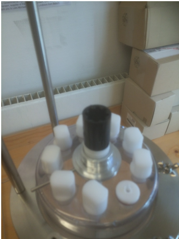
7 step; Place the rubber part